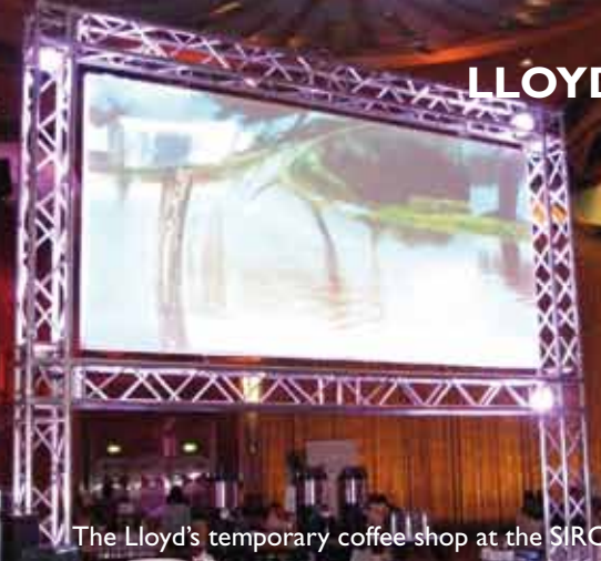
The Lloyd's temporary coffee shop at the SIRC