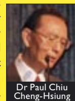
Dr Paul Chiu Cheng-Hsiung

Welcoming more than 400 delegates from 36 different countries, Dr Paul Chiu Cheng-Hsiung, Vice Premier of the Executive Yuan, Taiwan ROC, said yesterday during his keynote address, that 2008 marks an important year for Taiwan as the newly elected president Mr Ma Ying-jeou has announced bold projects to deregulate the economy to unleash vitality in the private sector. In stressing his commitment to build Taiwan as a regional financial centre, he said efforts will be made to broaden the depth of the local market.