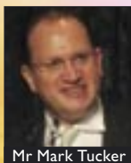
Mr Mark Tucker

On capital allocation as a strategic issue, Mr Mark Tucker, Group Chief Executive, Prudential plc of UK, said it was the most important of any CEO function as it has to ensure capital efficiency in generating profitable growth. Sharing the secret of Prudential's success especially in Asia where it had grown from being present in just three to 12 countries in