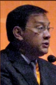
Mr Agus Martowardojo

He also encouraged insurance companies and markets to share their “special recipes for microinsurance with others”, adding that insurers already offering such services have showed “promising results”. Co-operation in developing and growing this line of business will be key to tapping the region's mass markets, he said.